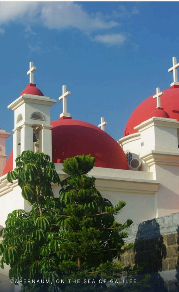
CAPERNAUM, ON THE SEA OF GALILEE