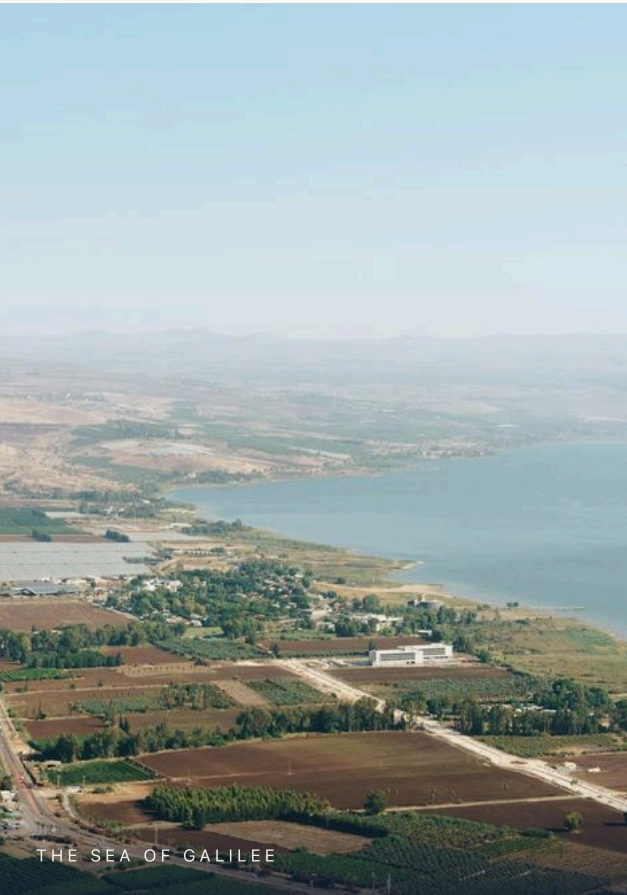
THE SEA OF GALILEE