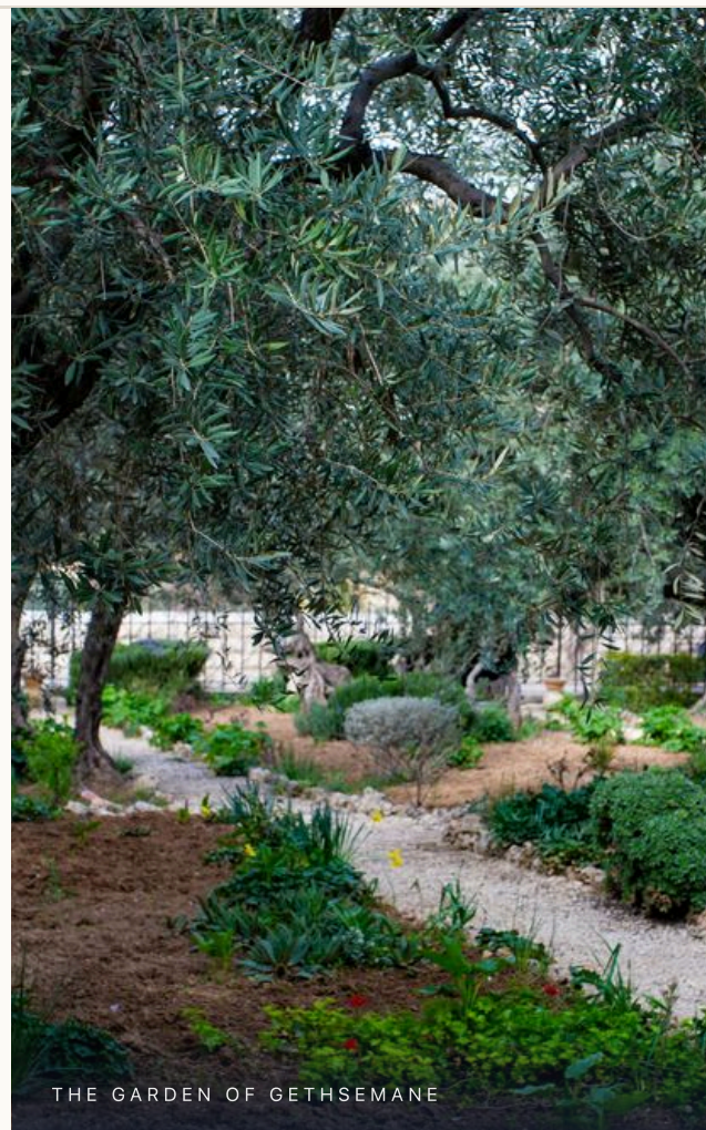
THE GARDEN OF GETHSEMANE