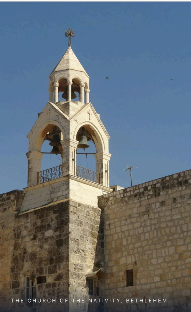
THE CHURCH OF THE NATIVITY, BETHLEHEM