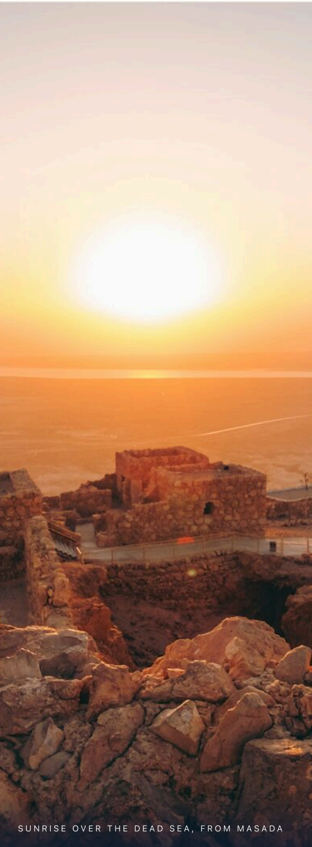
SUNRISE OVER THE DEAD SEA, FROM MASADA