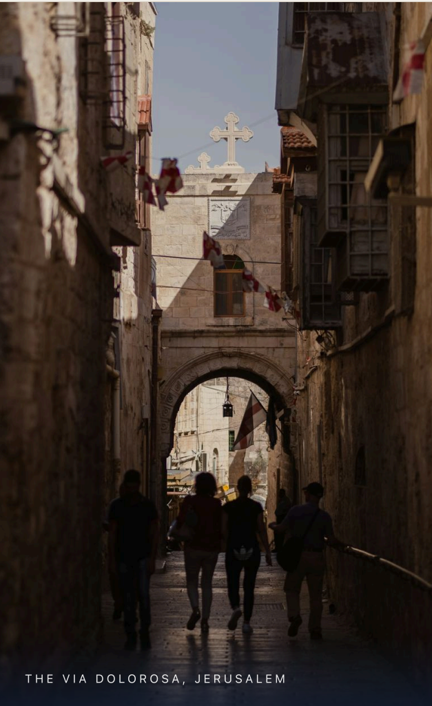
THE VIA DOLOROSA, JERUSALEM