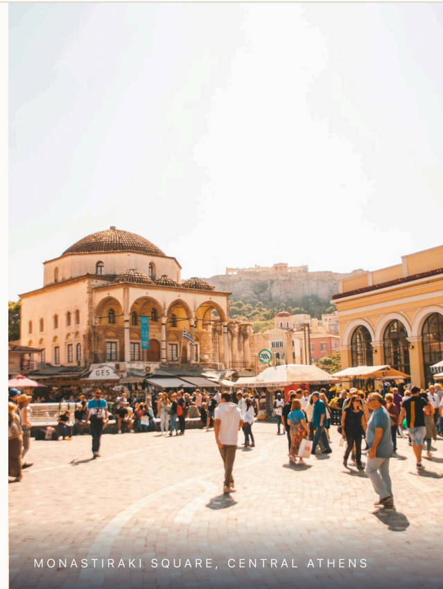
MONASTIRAKI SQUARE, CENTRAL ATHENS