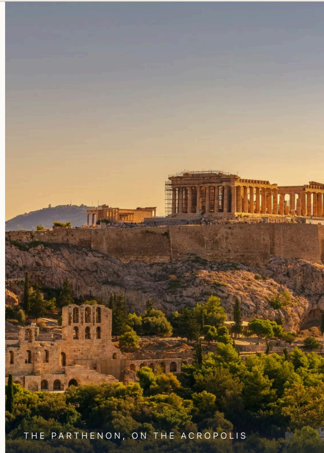
THE PARTHENON, ON THE ACROPOLIS