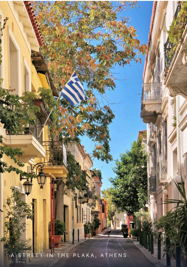
A STREET IN THE PLAKA, ATHENS