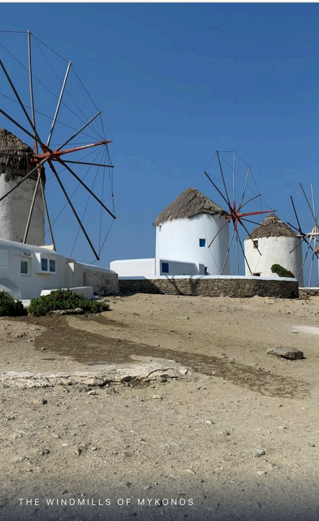
THE WINDMILLS OF MYKONOS