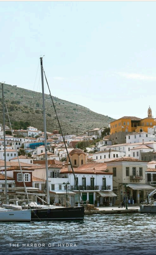
THE HARBOR OF HYDRA